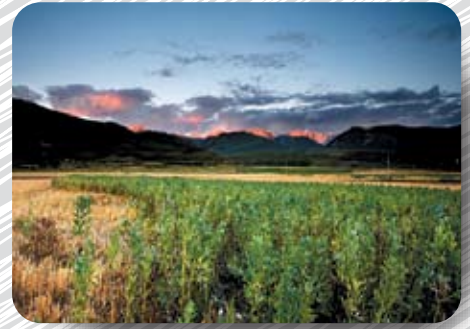
Before the earthquake, Sichuan was a beautiful place with stunning views.

In conclusion, the tremendous earthquake has brought some advantages to China. It has helped China to develop into a stronger country. After rebuilding Sichuan, the economic development of China will be faster. What's more, the earthquake has united the Chinese compatriots and aroused people's awareness of environmental protection. Education on natural science ought to be included in every state so as to enhance people's survival skills when facing natural disasters. Only by struggling for advancement will China be stronger and tougher.