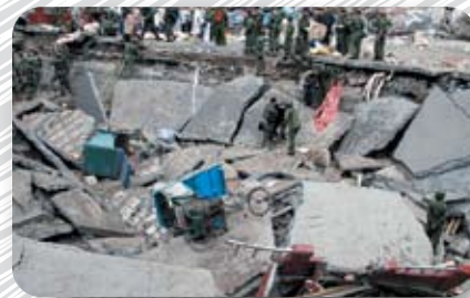
Buildings were seriously demolished after the earthquake. The army is rescuing the victims in the disaster.

Undoubtedly, natural disasters are really powerful, causing a great deal of losses and serious destruction. No matter how strong the protective equipment is, there is a certain degree of demolition after every natural disaster. Unfortunately, the serious earthquake measured at 8.0 Richer scale in Sichuan was destructive. It brought loads of critical losses including not only money but also precious lives. The tremendous quake and the aftershocks in Sichuan were really frightening, demolishing most of the buildings and making tens of thousands of people homeless. The most important things that they have to do now are calm themselves down and rebuild their homes as soon as possible. All compatriots around the world have great compassion for the victims in the quake. Actually, we can see a silver lining in the Sichuan quake.