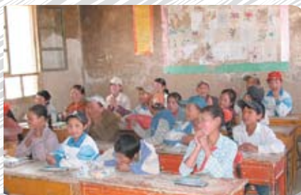
Education in rural areas is very important to help them learn survival skills.

Apart from this, it arouses people's awareness of environmental protection. After the tremendous earthquake in Sichuan, people value environmental protection more and more as some scientists claimed that the quake is partly caused by over-exploitation. Now, people know that they should stop exploiting earth resources in order to avoid natural disasters. They should consider more about the nature before they have any construction work done.