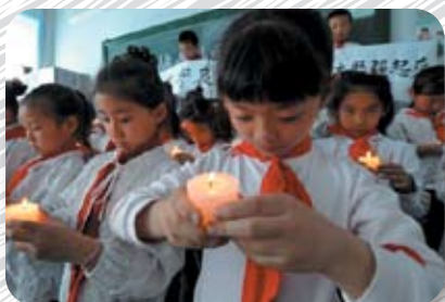
Students in China are mourning the death of the people in Sichuan.

To begin with, the disaster has united the Chinese compatriots. After experiencing the Tangshan earthquake, people have realized that they should help victims in the quake so as to minimize the loss of money and to save lives. We can see many people volunteering to go to Sichuan in order to speed up the rescue and help the victims just after the quake. It shows that many people are ardent in giving their helping hands to the Sichuan compatriots. The quake masses all the power of the Chinese to rescue the Sichuan people and minimize the loss of properties and lives.